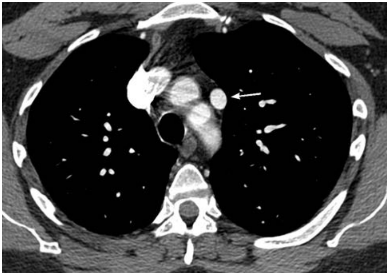
Figure 1. Axial computed tomographic scan of the chest demonstrating the vertical vein (arrow) along the left aspect of the superior mediastinum.

fulfilled the left-sided PAPVR review criteria. Of these, 6 discussed the rare left upper lobe type, as illustrated by our patient. Articles focused on the adult population, and 7 included case reports detailing a total of 8 patients (ranging in age from 33 to 68 years). The other 2 works were review-based and focused on CT findings or disease management. All of the articles used CT to assess and discuss pulmonary venous anatomy.