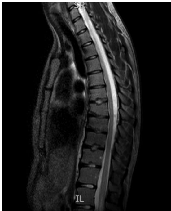
Fig. 2 Thoracic magnetic resonance imaging revealing multiple Schmorl's nodules and small disc herniation at T7–8.

a Kjaer et al (2005) reported intermediate/hypointense signal intensity and Tertti et al (1990) reported "abnormal discs"; these findings were determined to be indicative of degenerative disc disease and included in this category.