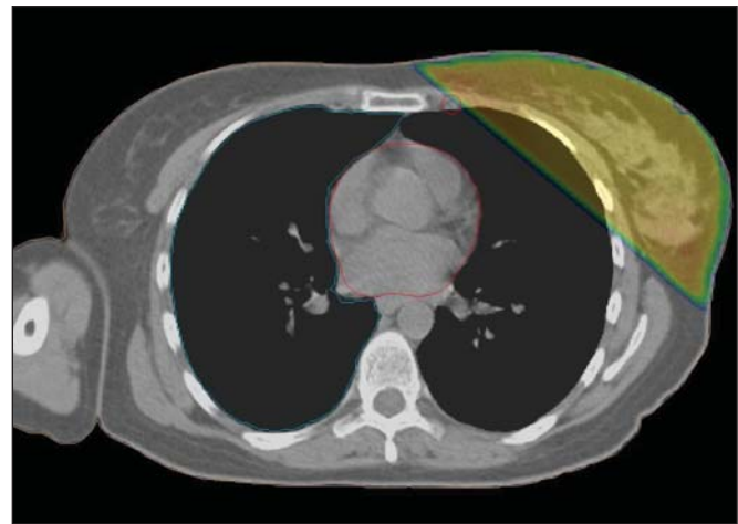
Figure 3. Internal mammary lymph nodes (red) and isodose curve (45 Gy; green).

dosimetric parameters analyzed (V45, D95, Dmax, Dmean, V25, and D50) presented higher mean values in the 3D planning ( p < 0.05 ). In the 3D planning, the median Dmax was 50.34 Gy, although the IMLNs received a mean of 20.64 Gy, the V45 for the IMLNs being only 15.8% (Figure 3). Contouring and dosimetric results are depicted in Table 2.