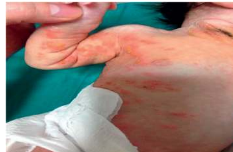
FIGURE 2: The appearance of skin lesions on the trunk and upper extremity of the patient.