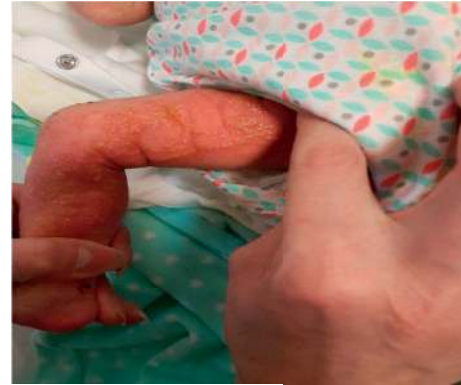
FIGURE 1: The appearance of skin lesions on the lower extremity of the patient. Note the linear pattern of the skin lesions.

Skin punch biopsy revealed an ulcerative lesion with a fibrinous cap and spongiotic vesicles (Figure 4) with marked eosinophilic exocytosis associated with dyskeratotic keratinocytes and eosinophilic intraepidermal microabscess formation (Figure 5). The aforementioned histopathologic findings confirmed the diagnosis of IP.