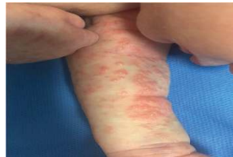
FIGURE 3: The appearance of skin lesions on the arm of the patient.