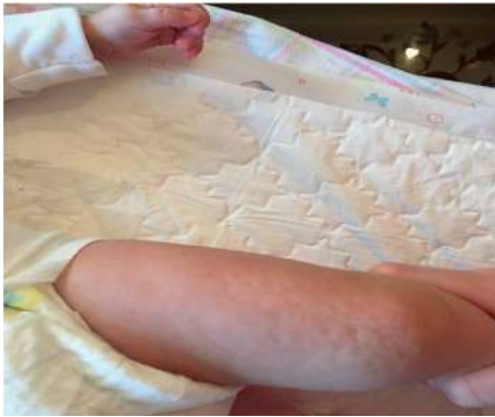
FIGURE 6: Disappearance of skin lesions in 11-month old.

Eye, CNS, and skeletal examination did not have any problem. She was prescribed topical antiseptics and mupirocin ointment and was eventually discharged with a fairly complete improvement of the lesions. In the repeated patient's follow-up until the age of 11 months, eye and CNS evaluations were unremarkable; also skin lesions have been completely improved (Figure 6).