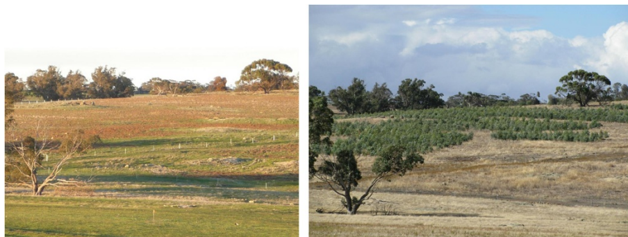
Figure 2 Ridgefield before (2 August 2010) and after (17 April 2012) planting to restore multiple functions.