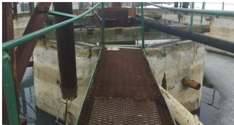
Fig. 2. Clarifier-digester at the wastewater treatment plant of Khorol factory for baby food

At the WWT plant of the Khorol factory for baby food, the clarifiers-digesters are installed in accordance with the typical project 902-2-315 with the size of the facilities d=12\text{m} , h=9,48\text{m} and the size of the clarifiers d=5\text{ m} and h=7,75\text{m} , the technological volume of digester – 540\text{ m}^3 . At the treatment facilities, two nodes of the clarifiers-digesters with the number of units 4 and 2 are installed. The clarifier and digester are separated from each other to avoid the possibility of digested sludge falling into a zone of clarifying and ensures a reduction of concentrations of suspended substances in wastewaters by 70% and \text{BOD}_T by 15%.