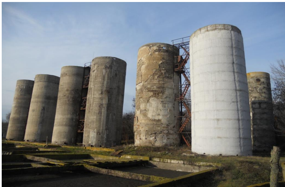
Fig. 3. Tower biofilters of the wastewater treatment plant of Khorol factory for baby food

Chemical analysis of wastewater samples before and after the tower biofilters allows to determine the efficiency of the tower biofilters work. The results are presented in Table 3.