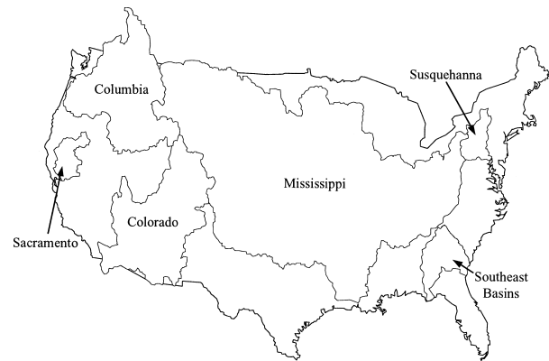
FIG. 2. Locations and extents of the watersheds used in this study. The Southeast basins include the Savannah, Altamaha, and Apalachicola watersheds.

We should explicitly reiterate here that our analysis assumed long-term equilibrium in the hydrological budget’s storage terms, and it should be noted that the observed trends in the fluxes are small relative to the magnitudes of storage terms within the budget. Inclusion of