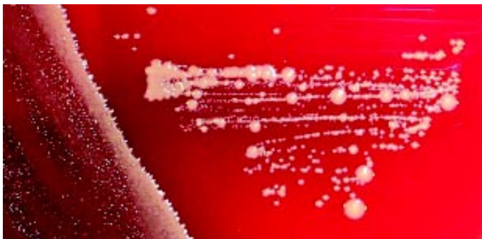
Figure 2. A blood agar plate incubated for 24h at 35°C in which the multiple colonial morphologies of the Michigan VISA strain can be observed. The large cream colored colonies and smaller gray colonies demonstrated the same antibiogram (vancomycin MIC = 8 µg/ml) and pulsed field gel electrophoresis profiles.

Most VISA isolates initially appear mixed, demonstrating two distinct colony types; however, both colony types yield identical antimicrobial susceptibility test results (Figure 2). Decreased susceptibility to vancomycin (i.e., an MIC of vancomycin of 8 µg/mL) was detected in the S. aureus isolates from Michigan and New Jersey by broth microdilution when