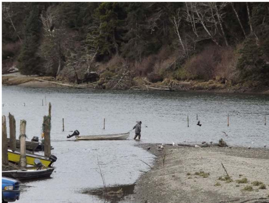
Fig. 1 Map showing tribal lands in the western USA and the locations of the five tribes on which this study was based

The lead author interviewed 24 members of the five tribes. The participants were chosen based on their