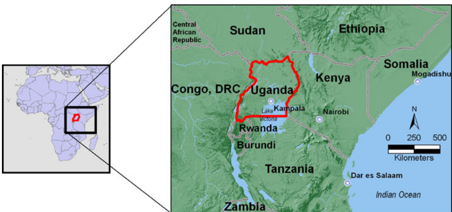
Fig. 1 Map of Africa, showing Uganda in East Africa

The research site, Rakai District in southwestern Uganda near the border with Tanzania, was selected based on several criteria, the main ones being its vulnerability to climate stress and the local predominance of agricultural livelihoods, to which climate forecasts can be applied more readily than they can to livestock-based systems. Because of its exposure to climate risk, Rakai is also one of the priority districts in the National Adaptation Programme of Action (NAPA), and the District Agricultural Office was particularly well disposed to assist by helping us contact farmers. In addition, we sought areas where Luganda (the language of the Baganda people, Uganda's largest ethnic group) was spoken as the prevalent language, since the research entailed linguistic analysis and our research team had expertise in that language. Within the district, which is diverse in terms of agro-ecological and climatic conditions and livelihood systems, we selected two sub-counties (units of local government) that best satisfied these criteria (Figs. 1, 2 and 3).