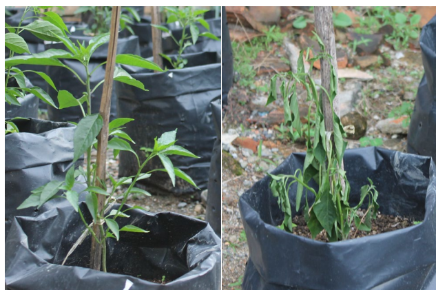
Figure 2. Chili plants 3 weeks after inoculated with R. syzigii subsp. indonesiensis , introduced with B. pseudomycooides strain NBRC 101232 (left) and control (right)

Note: Means with the same letter are not significantly different by Duncan multiple range test at p < 0.05