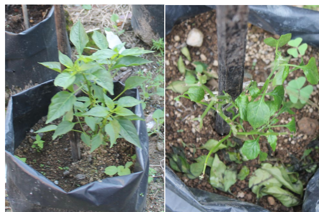
Figure 3. Chili plants 3 weeks after inoculated with Foc , introduced with B. thuringiensis strain ATCC 10792 (left) and control (right)

Besides, it had good ability to promote growth rate, all strains also had good ability to increase yields of chili pepper. All strains increase the yields with varied effectivity from 17.78 to 186.67%. Strains B. pseudomycooides strain NBRC 101232, B. thuringiensis strain ATCC 10792 and B. mycooides strain 273 respectively increase yields to 1.29 kg, 1.22 kg, and 0.99 kg compared to control 0.45 kg.