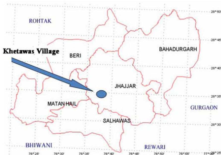
Figure 1 Map of the district Jhajjar showing the study area.

adjoining areas [15-18]. The voucher specimens were deposited in the herbarium of Genetics Department, M. D. University, Rohtak.