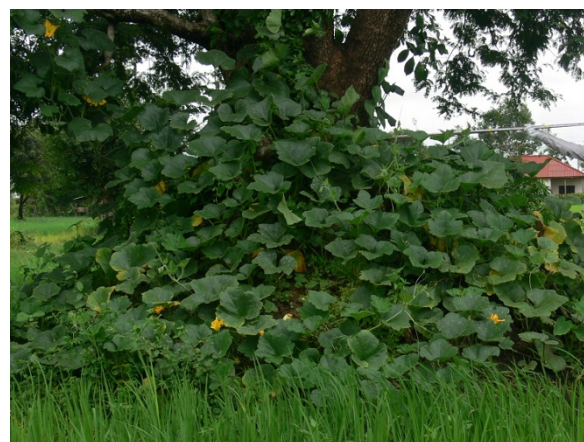
Figure 2 Termite mound for vegetable (pumpkin) growing. Base diameter and height of mound were ca. 3 m and ca. 1.5 m, respectively. Termite species was unknown.

respondents also used the termites as fishing bait and chicken feed. No other forms of mound soil utilization were found.