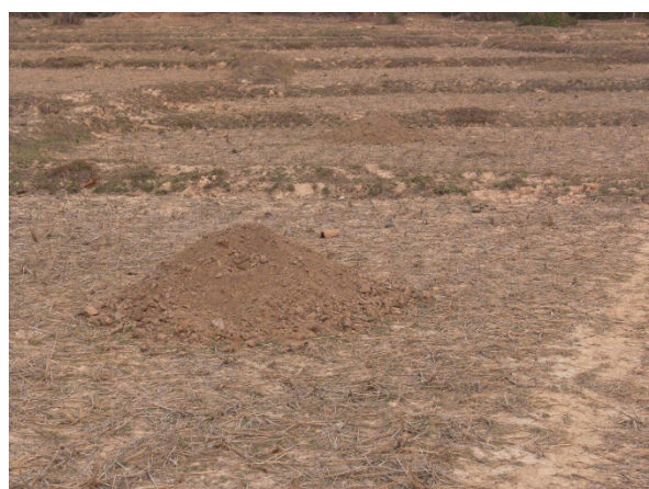
Figure 1 Termite mound soil placed in paddy field before plowing. Width of soil mound was ca. 80 cm. Termite species was unknown.

It was usually observed in the early rainy season that villagers catch emerged termites (alate) and eat them after broiling (Figure 5). Wherever the alate first land, they immediately lose their wings. Villagers use water basins to catch the termites and prevent them from escaping. They also collect termite mushrooms ( Termitomyces sp./spp.) for eating and for sale on markets. The mushrooms are the most prized wild mushrooms in the Vientiane Plain due to their flavor [19]. Various kinds of natural resources are used by the villagers, most of which are sold on markets to earn cash [20].