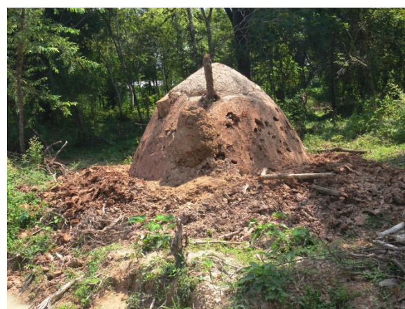
Figure 3 Termite mound for charcoal kiln. Base diameter and height of kiln were 2.4 m and 1.8 m, respectively. Termite species was unknown.