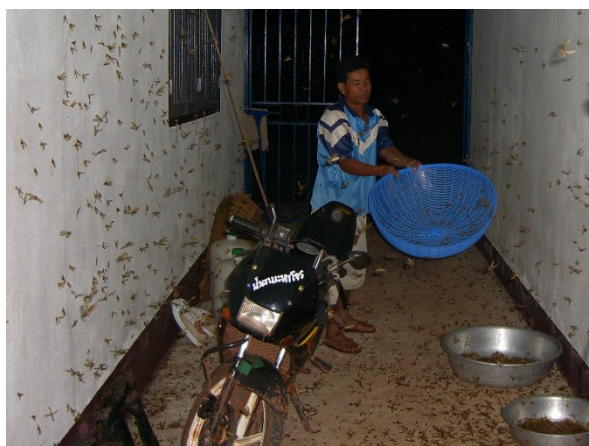
Figure 5 Catching emerged termites for eating. Termite species was unknown.

The volume of 53 mounds, including mounds that had been cut, was measured individually 3 times from March to November (Table 3). The average volume increase was -0.077 m 3 from March to July and 0.002 m 3 from July to November. The negative growth in the former period may have been caused by the cutting out of