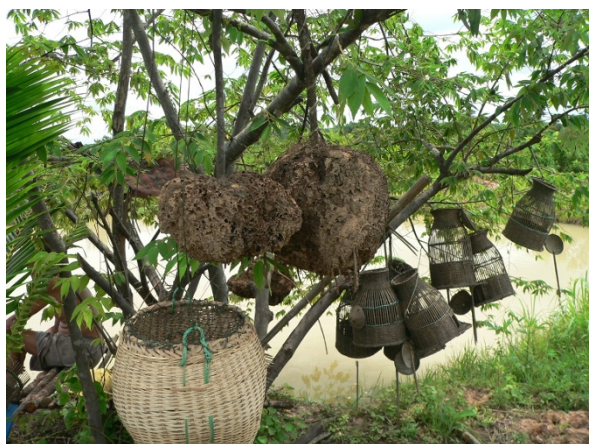
Figure 4 Termites in mound soil prepared for fish feeding. Termite species was unknown.