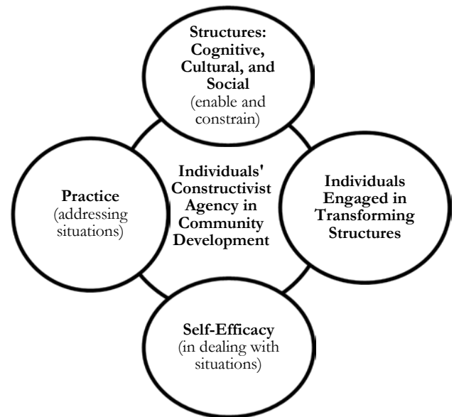
Figure 2 Individuals' Constructivist Agency in Community Development

Cognitively, they deployed their self-efficacy, a high level of belief in their capability and desire to do something about their situation (Bandura 1977). They believed in the possibilities of achieving their goals. Bandura (1989) argues that an understanding of external factors, those within the socio-cultural environment, influences an individual's self-efficacy. I would argue that this entails meaning-making (a cognitive process that involves changes in one's thought patterns) and learning while negotiating social and cultural structures, then deciding, if so inclined, to act. Individuals' engagement in such transformative agency thus demands deploying one's self-efficacy (a cognitive matter) to confront one's habitus (dispositions in one's thinking and acting) and venture into new behaviors as one negotiates cultural and social expectations. These individuals do not passively take in knowledge and use it as has been socio-culturally stipulated but challenge the foundations of the routine knowledge claims and venture into new understandings and action.