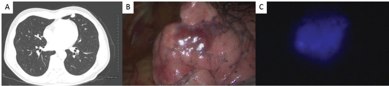
Fig. 1 (A) A chest computed tomography image shows a 15-mm nodule in the left upper lobe. (B) White light mode shows a reddish-brown change at the pleural surface of the lingular segment. (C) ICG fluorescent mode shows clear blue fluorescence in the lingular segment. ICG: indocyanine green