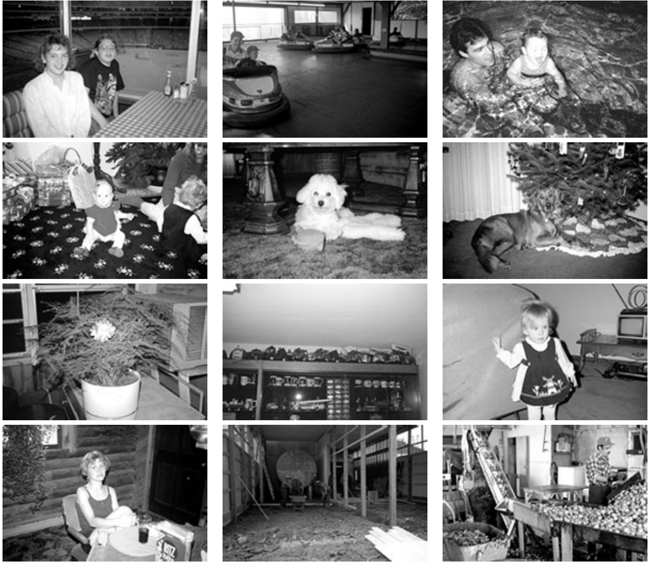
Figure 5: 12 out of 69 misclassified indoor images (combined color and MSAR classifier). Plants, Christmas trees, green walls and brown floors are sometimes mistakenly thought to belong to outdoor scenes. The other 561 indoor images were correctly classified.