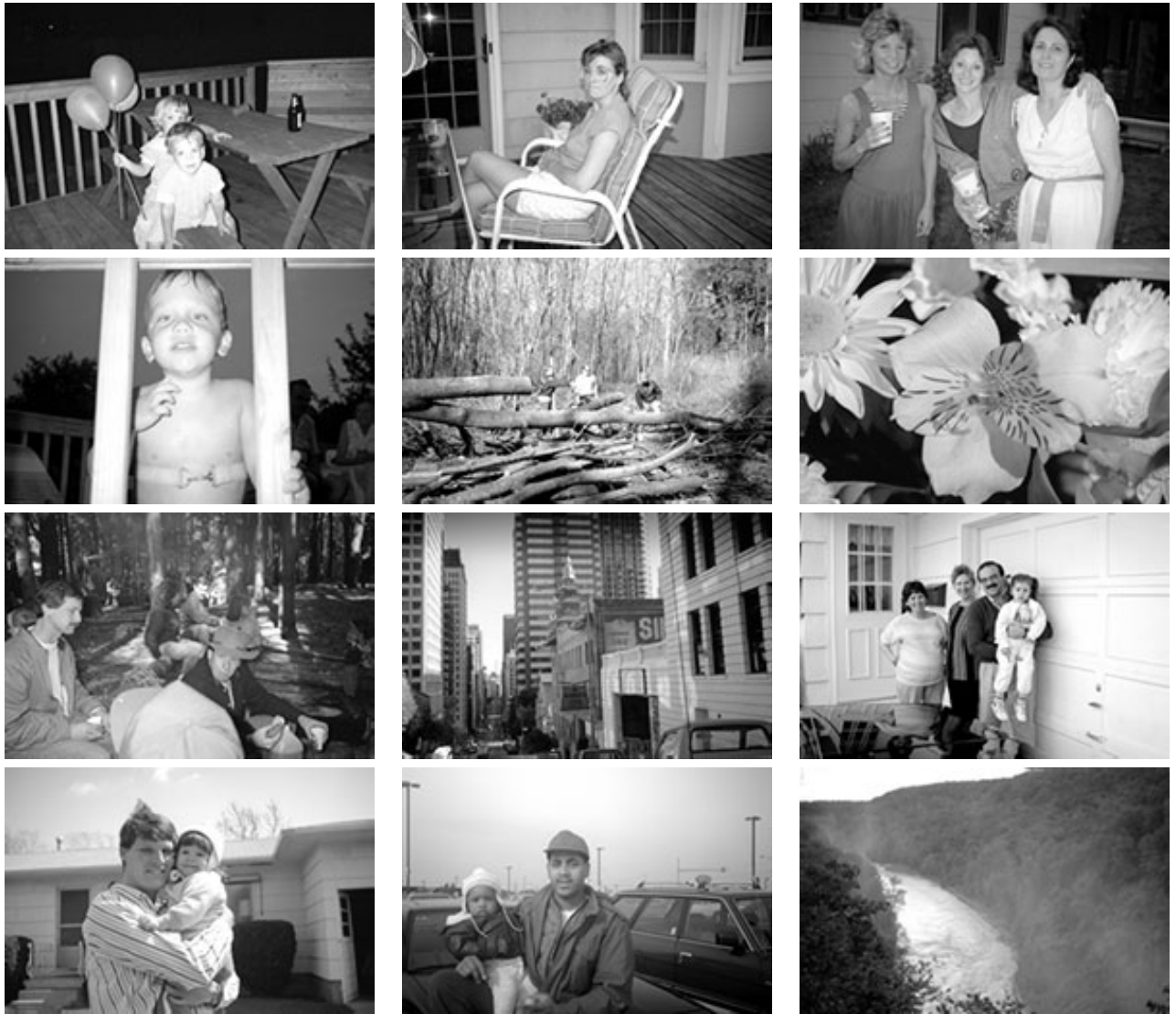
Figure 4: 12 out of 60 misclassified outdoor images (combined color and MSAR classifier). Outdoor flash photos in dusk or at night are especially difficult, as are scenes with white regions (walls, hazy sky). Close-ups are also challenging, since they are dominated by one object and do not provide much context. The other 634 outdoor images in the database were correctly labelled.