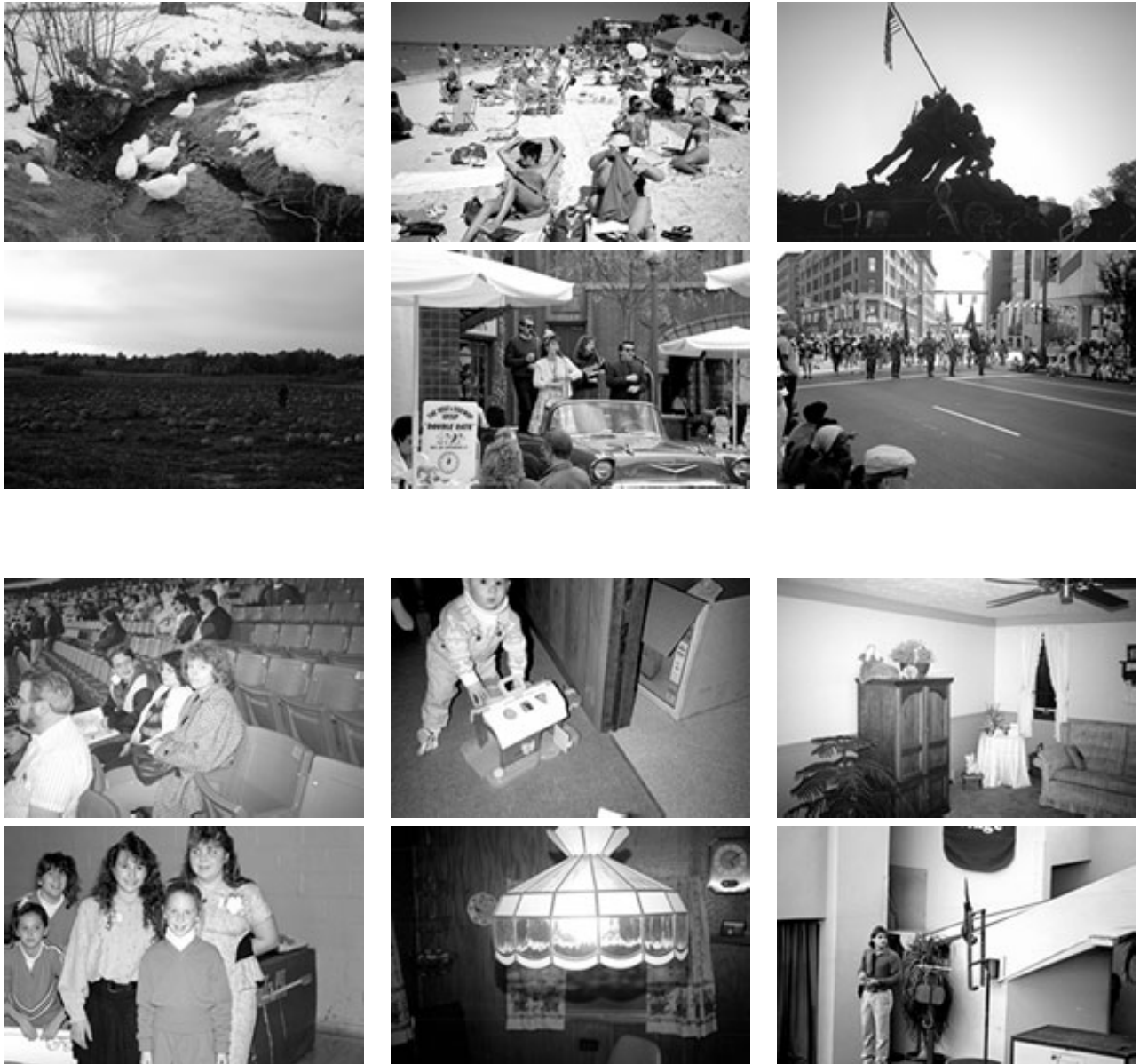
Figure 3: Images correctly classified by the MSAR and color combination, but incorrectly classified when using only color. The top 6 are outdoor images, the bottom 6 are indoor. The color classifier often assumes that white areas are part of an indoor image (presumably a wall), thereby missclassifying snow scenes. The MSAR corrects these scenes. See http://www.media.mit.edu/~szummer/caivd98/ for color versions of the images.