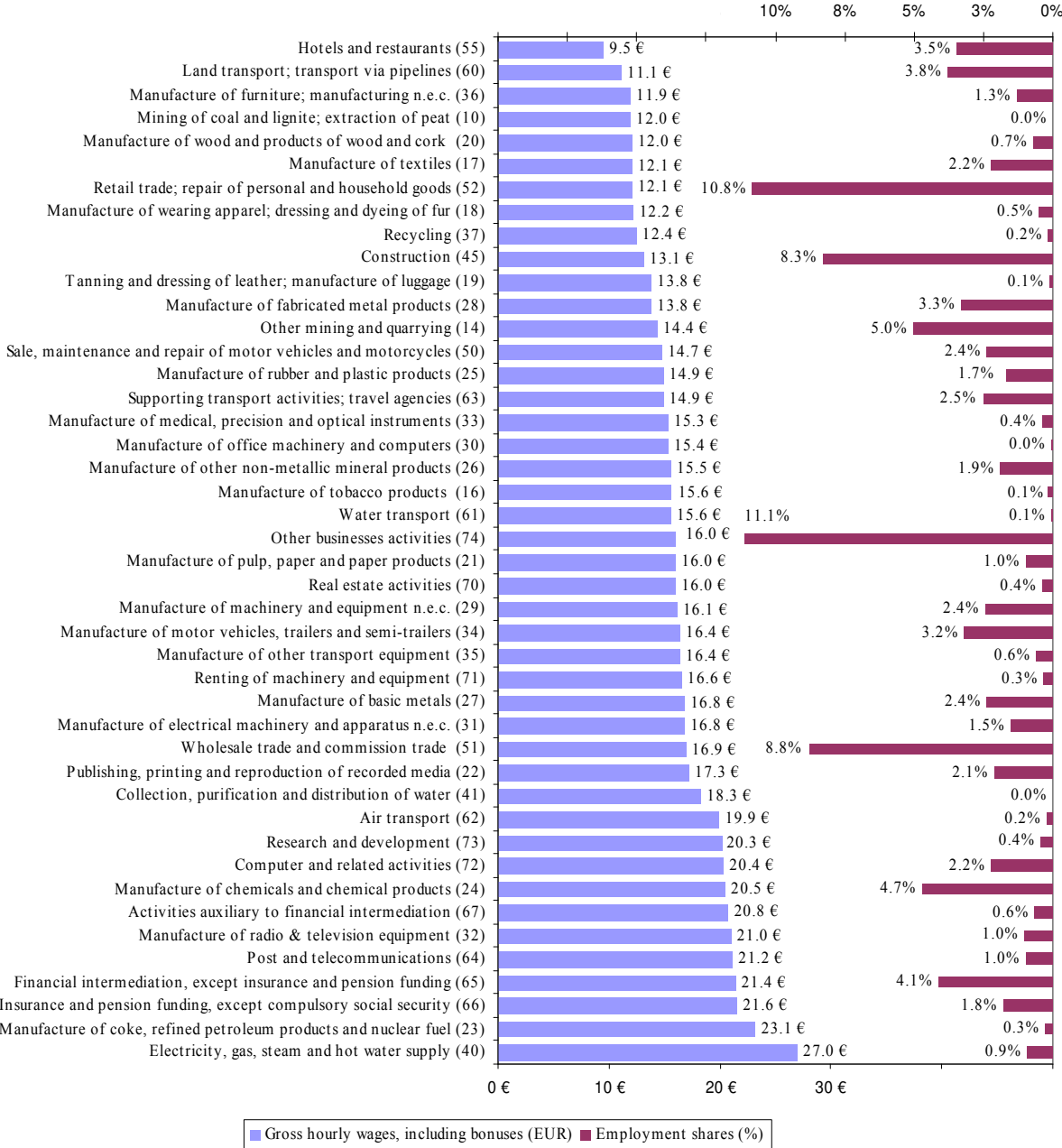
Figure 1: Gross Hourly Wages (Including Bonuses) and Employment Shares for Nace Two-Digit Industries, 2002

(652 in 2002 vs. 502 in 1995) and that the majority of the workforce is employed in Flanders (62 per cent in 2002). Finally, let us notice that the proportion of workers whose wages are collectively renegotiated at the company level has been decreasing from approximately 39 to 20 per cent between 1995 and 2002. The majority of workers have their wages thus solely determined through national and/or sectoral collective agreements.