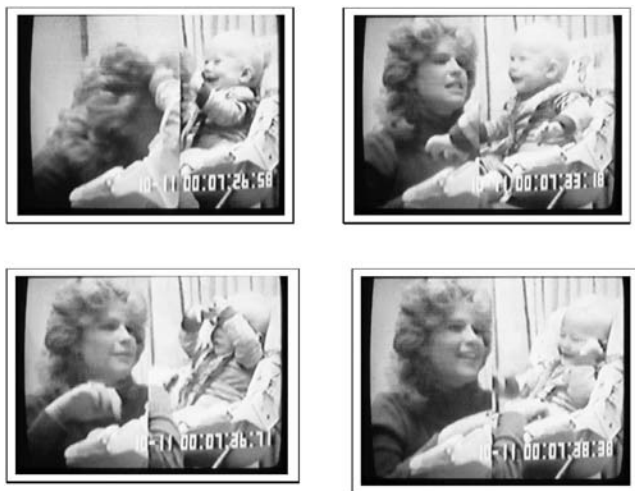
Figure 1 Mother and Infant Interaction

Note. Left to right: The infant pulls the mother's hair. When the mother disengages, the infant holds on, and the mother responds with an angry facial expression and vocalization. The infant reacts defensively. After some seconds, they both repair the interaction.