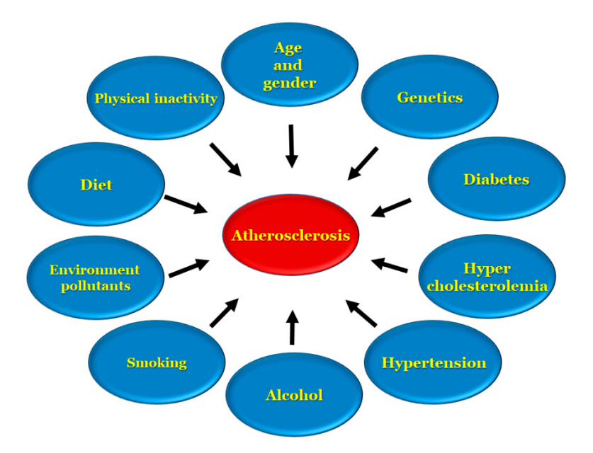
Figure 1. Risk factors associated with atherosclerosis.

Apolipoprotein B is a key factor that remains in the subendothelial layer in which a maladaptive nonrevolving inflammatory process begins, which over the course of time acts as a stimulant for atherosclerosis progression [28–32]. Stroke and heart disease induced by atherosclerosis are two of the leading causes of death in the United States, and are the underlying cause of conditions, such as coronary artery disease, ischemic gangrene, and abnormal aortic aneurysms [3]. There are several risk factors, [4,33,34] involved in the development of atherosclerosis, including age, genetic and environmental factors, high cholesterol, low density lipoprotein presence, high density lipoproteins in low levels, diet, alcohol, smoking, diabetes, hypertension and an inactive lifestyle, as represented in Figure 1.