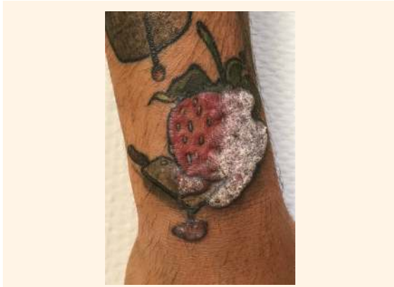
Figure 4: Clinical photograph of the right wrist of a 35-year-old male patient (case three) showing a verrucous reaction to the red ink of a strawberry tattoo.