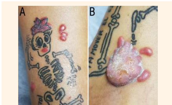
Figure 1: Clinical photographs of the right leg of a 38-year-old female patient (case one) showing an inflammatory reaction to the red ink in a skeleton tattoo.