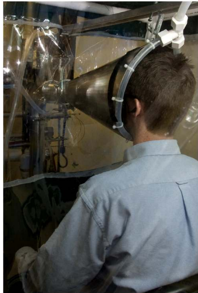
Figure 2. Exhaled breath collection system. Each volunteer sat as shown with face inside the inlet cone of the human exhaled breath air sampler inside a booth supplied with HEPA filtered, humidified air for 30 min while wearing an ear-loop surgical mask. Three times during the 30 min each subject was asked to cough 10 times. After investigators changed the collection media, the volunteer sat in the cone again, without wearing a surgical mask, for another 30 min with coughing as before.

RNA extraction in Trizol-chloroform, reverse transcription, and quantitative PCR were performed as previously described [1,32]. Quantitative PCR was performed using an Applied Biosystems Prism 7300 detection system (Foster City, CA) for coarse fraction samples or a LightCycler 480 (Roche, Indianapolis, IN) for the fine particle fraction. Duplicate samples were analyzed using influenza A and B primers described by van Elden et al. [33] A standard curve was constructed in each assay with cDNA extracted from a stock of influenza A (A/Puerto Rico/8/1934, Advanced Biotechnologies Incorporated, Columbia, MD) with a concentration of