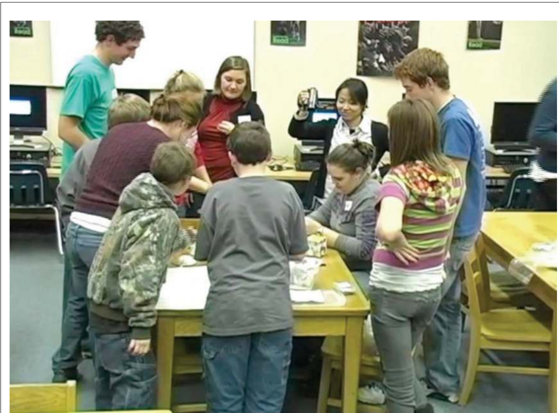
Figure 2. Youth, instructors, and facilitators working together.

three-hour workshop where the instructors engaged with the curriculum themselves. Training for the volunteer facilitators took place separately in a two-hour session and focused mainly on basic questioning strategies, ways to provide encouragement, means for keeping the youth on task, and positive mentoring techniques. All facilitators were undergraduate students: three majoring in engineering, one majoring in biology, and two majoring in the humanities. Three facilitators were female and three were male. Two boys were placed with a male mentor, a boy and girl were placed with a female mentor, two girls were placed with a male mentor, and two boys were placed with a female mentor. The final two female mentors floated between groups and assisted the instructors.