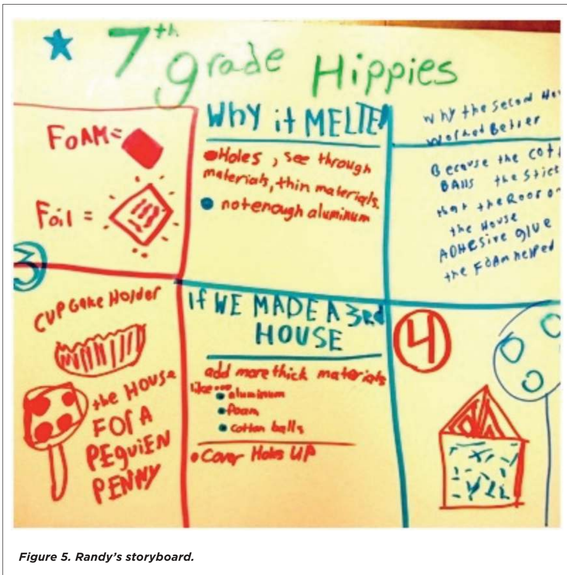
Figure 5. Randy's storyboard.

terms of bringing in web content from other locations on the Internet, as well as using PowerPoint to compose a presentation at the end of the project (see Figure 6).