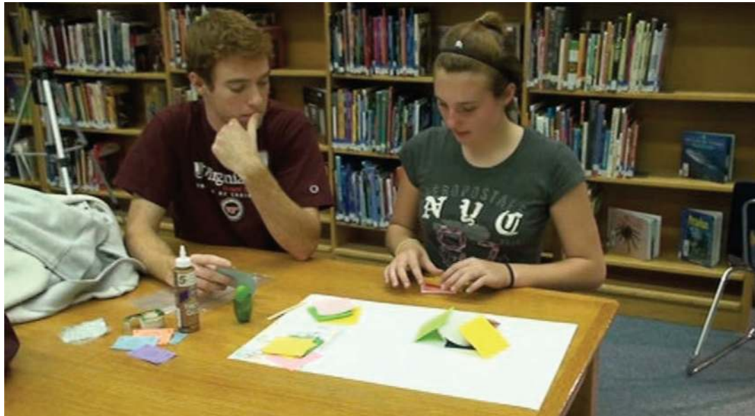
Figure 3. Engineering student facilitator (left) with a middle school youth.

Brian: Conduction is...an insulation...it's like electricity.