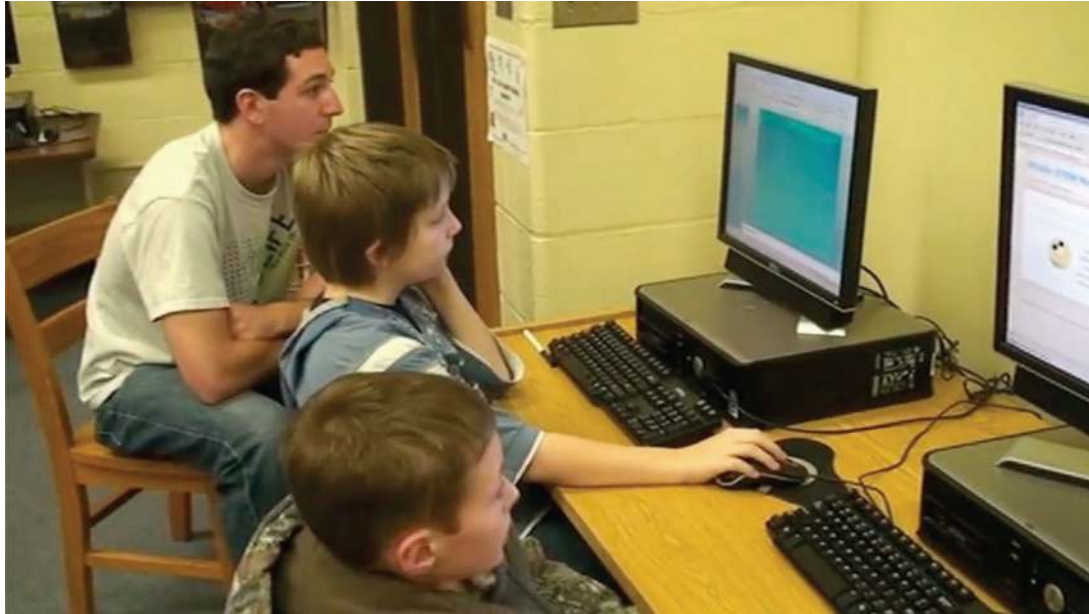
Figure 6. Facilitator working with two youth on their Moodle sites.

how the facilitators and instructors affected youth's motivation to participate in the Studio STEM design activities. We will discuss the results from the questionnaire and video analysis within the context of the identification model presented by Osborne and Jones (2011). The parts of the model that were most relevant to the present study are presented in Figure 1.