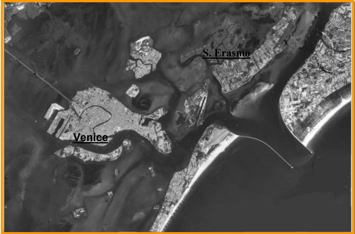
Figure 1. The Island of S. Erasmo in the Lagoon of Venice