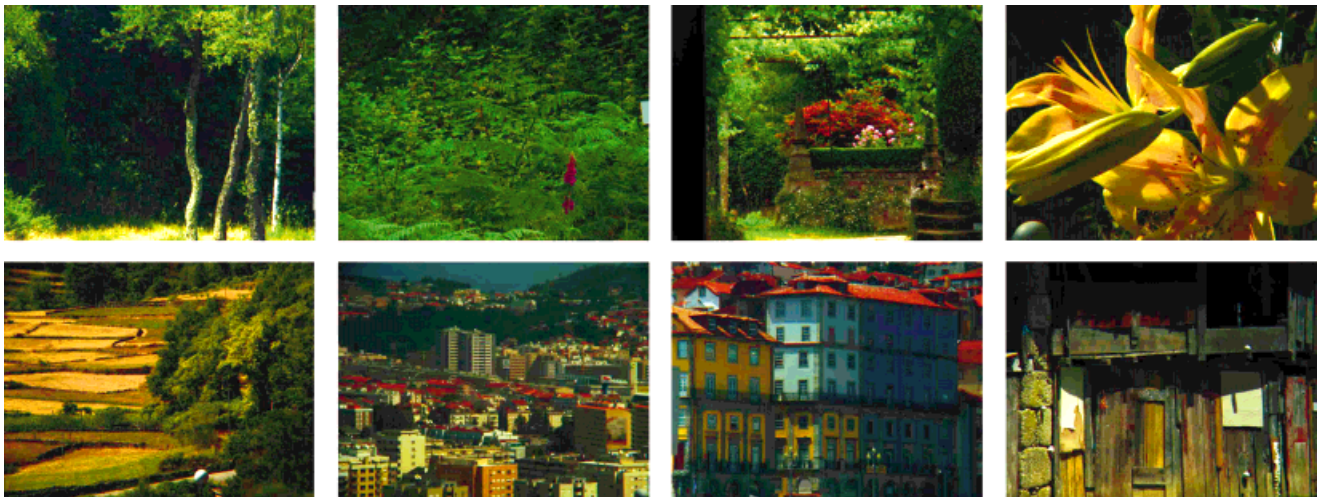
Fig. 1. Examples of color pictures obtained from a sample of 25 hyperspectral images of rural and urban scenes.

The codes in (1) and (3) provide information about the color of single surfaces and the codes in (2) and (4) provide information