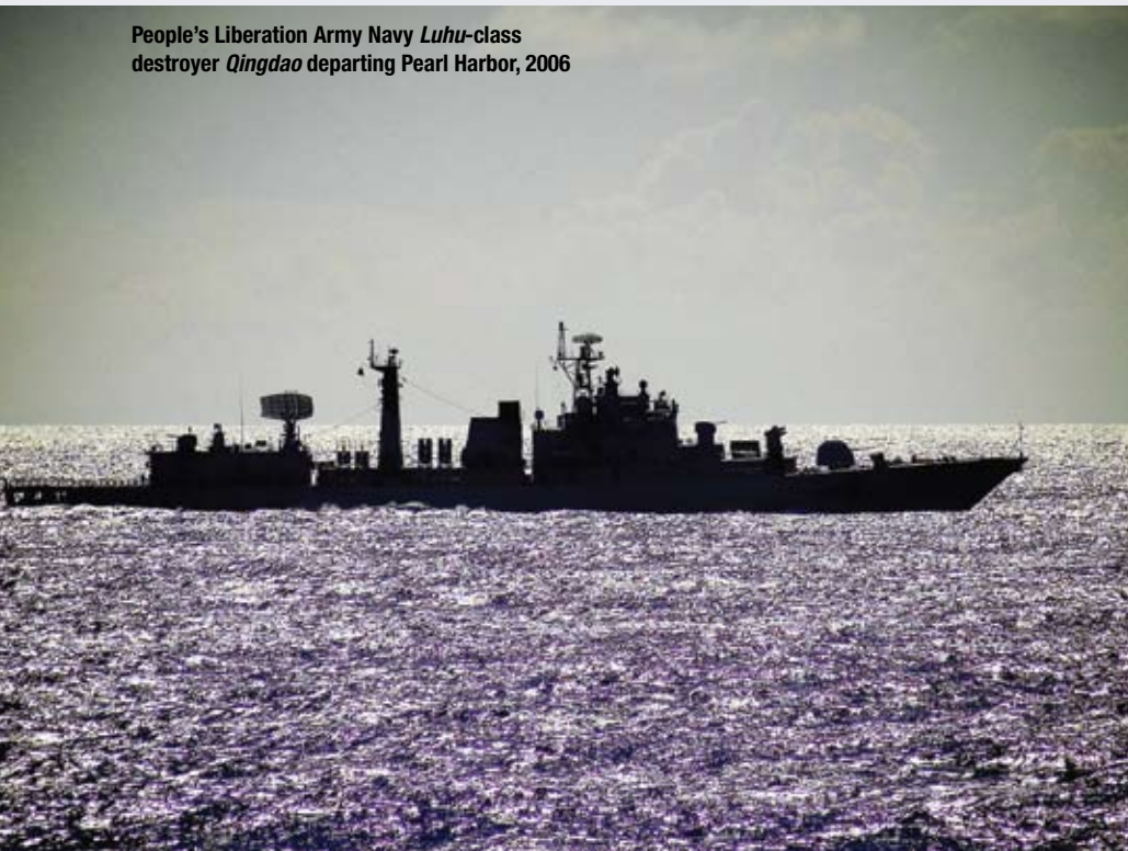
People's Liberation Army Navy Luhu -class destroyer Qingdao departing Pearl Harbor, 2006

Unmanned reconnaissance systems appear to be another area of emphasis in Chinese C 4 ISR-related research. Indeed, recent technical articles indicate that scientists and engineers are conducting research on various types of unmanned aircraft systems. 21 Researchers are also working on unmanned underwater vehicles. For example, PLAN researchers are addressing the sonar capabilities of remotely operated vehicles, 22 which could have applications in ISR and other maritime warfare mission areas.