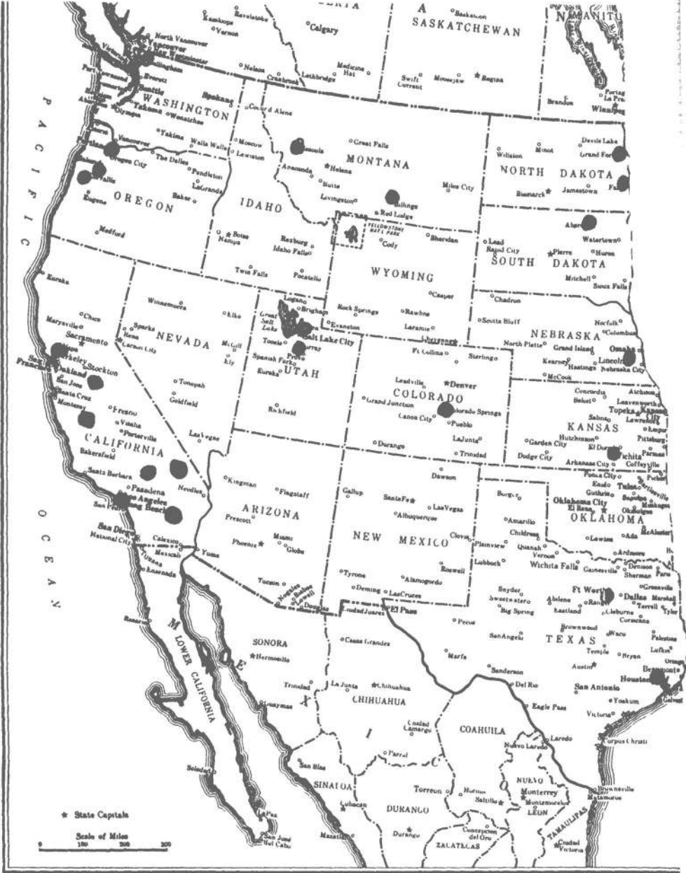
Figure 2. Map of the United States showing locations in 1932-1933 of libraries that either owned Ulysses or would add it to their collections if available.