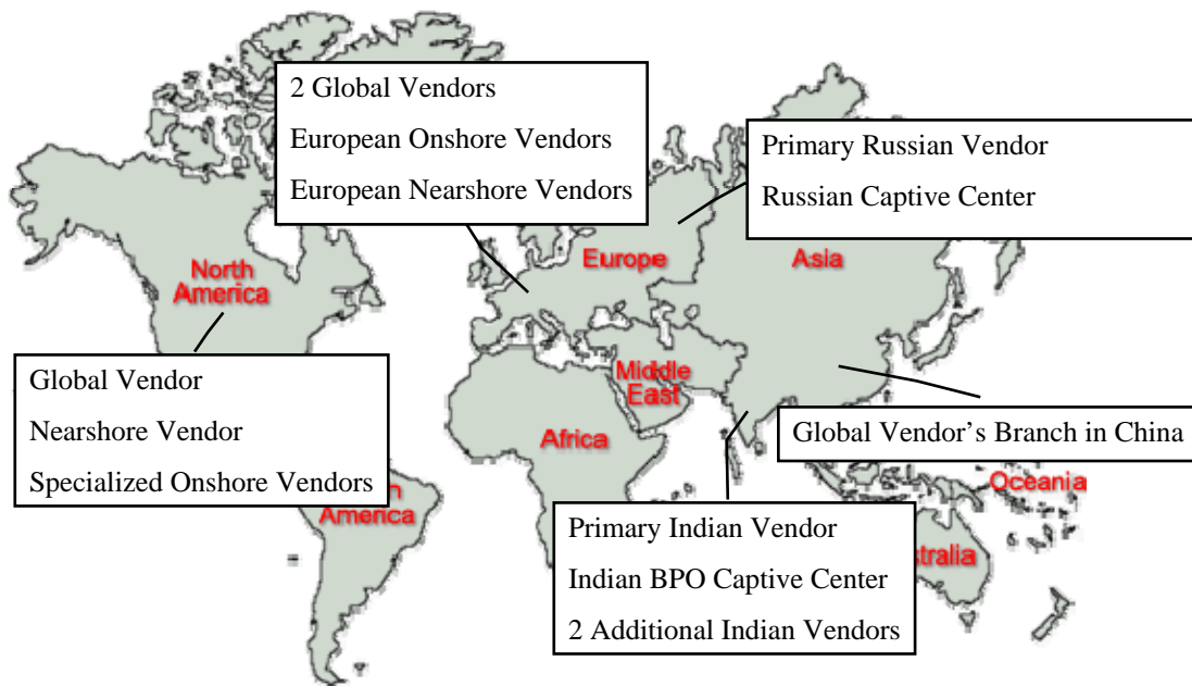
Figure 1. Global Bank's Provider Relationships