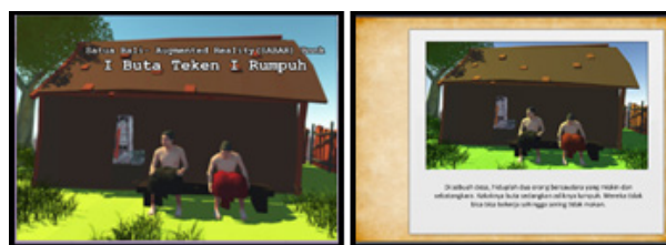
Figure 3. Display Example on Android Based Application