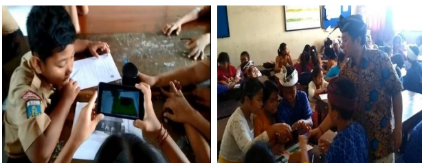
Figure 5. Try Out Activity in 5 th Grade of Elementary School's Students

A try-out process was carried out to know the feasibility and the effect of SABAR application. One of the try-out activities is shown in Figure 5.