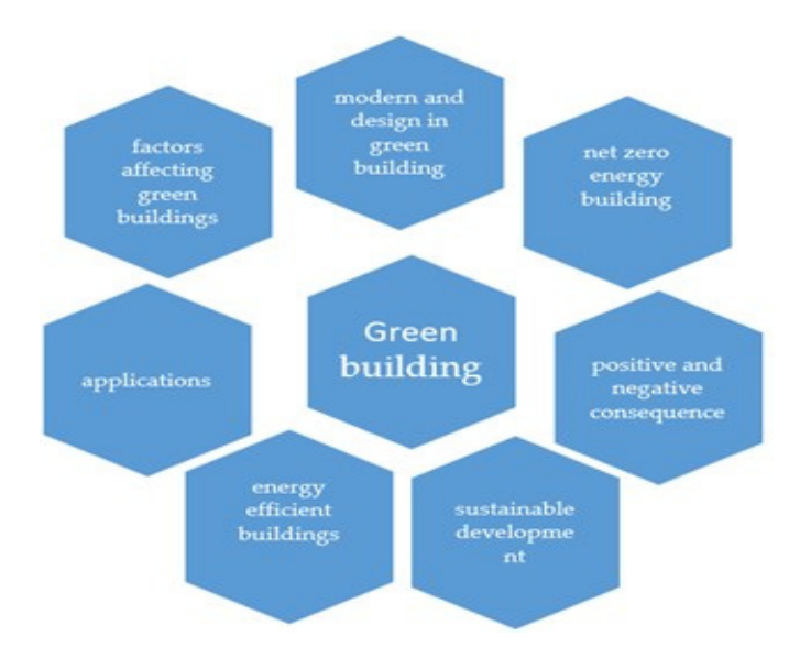
Figure 1. Various technologies and approaches, based on which, this review study has been conducted.