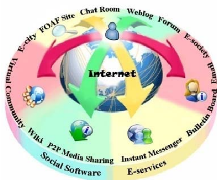
Fig. 3 Different type of social networks

these networks, mining in these large-scale of data, can provide better and efficient usage of hidden potential of this type of networks [39].