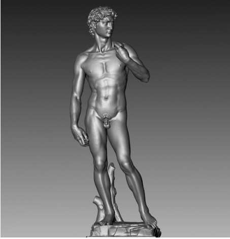
Fig. 1. A rendering of a scanned version of Michelangelo's David (Michelangelo's project)

a slightly slower algorithm than the one reported in [8]). We present below both the underlying theory and examples for real data.