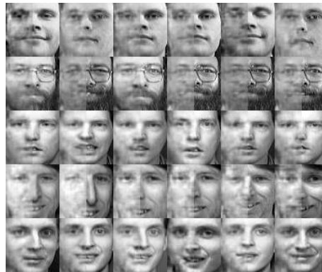
Figure 3. Example test set image completions of the ICNN with bundle entropy.

Table 1 compares several different methods for this problem. Our PICNN’s final macro-F1 score of 0.415 outper-