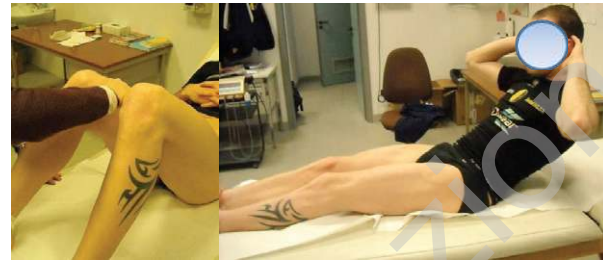
Figure 5. Specific clinical tests.

Pain can also be reproduced with the adduction of the abdominal, the ilio-psoas, the rectus femoris and the adductor muscles against resistance and with passive stretching of the adductors and ilio-psoas muscle (Fig. 5).