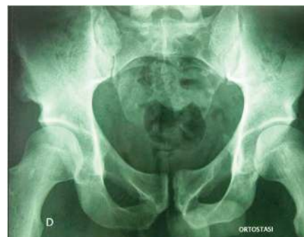
Figure 6. Involvement of hip joint.

Ultrasound evaluation provides the assessment of musculotendinous structures, soft tissues and insertional area of tendons, ligaments and the fascia on the cortical bone. It is a repeatable test, useful as a follow-up, which could be performed both by comparing contralateral structure and dynamically 18 . Therefore ultrasound scan is helpful in differentiating the acute trauma from an overload injury and, as