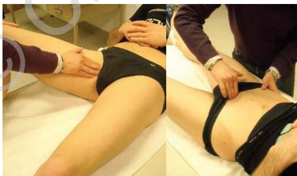
Figure 4. Painful points.

Anterior observation is important to assess knee axis and rotula orientation. Moreover, in case of suspected inguinal hernia or sports hernia, it is helpful to evaluate the testicles and the inguinal canal with the Valsalva manoeuvre. Symmetry of posterior superior iliac spines and of the malleolus could be examined with the patient lying in supine position to assess the potential dysmetry of lower limbs. Subsequently painful points like tendon insertions of adductor, recto-abdominal and ilio-psoas muscles, pubic symphysis and iliac spines are evaluated (Fig. 4).