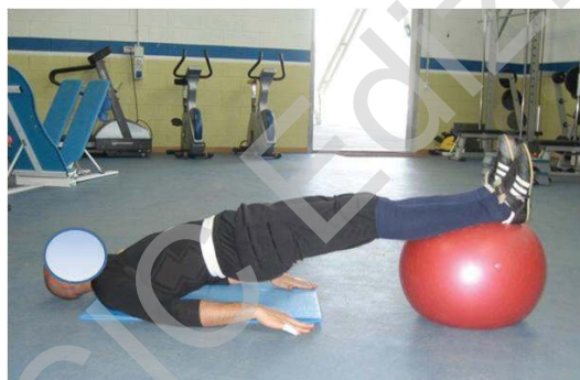
Figure 10. Core stability exercises.

The return-to-sport phase of rehabilitation consists of aerobic running with increasing speed. Gradually short but