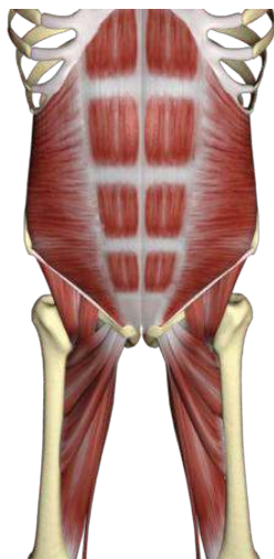
Figure 1. Anatomical view.

the obturator foramen and innervates adductor muscles and a small area of skin in the inner aspect of the thigh. The medial and intermediate cutaneous nerve of the thigh (L2-L3), with sensory function, runs below the inguinal ligament and innervates the lateral aspect of the thigh and the superior-external portion of the glutes. The femoral nerve (L2-L4), a mixed nerve, runs below the inguinal canal and innervates the quadriceps femoris, the ilio-psoas, the pectineus, the sartorius muscle and the anteromedial aspect of the thigh 6 (Fig. 1).