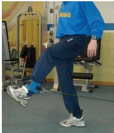
Figure 9. Concentric and eccentric exercise.

In sub-acute phase, muscle strengthening is increased by the introduction of concentric and eccentric exercises (Fig. 9) and by cardiovascular reconditioning in the gym or in a therapeutic swimming pool.