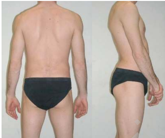
Figure 3. Lumbar hyperlordosis with pelvis anteversion.

Lateral examination of spinal curvatures, the rotation of the pelvis and the posture of hips and knees should be done. For example, a typical report of the adductor syndrome is the lumbar hyperlordosis with pelvis anteversion (Fig. 3).