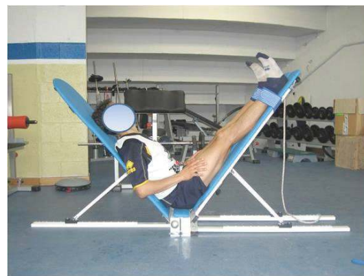
Figure 8. Global and site specific stretching.

Rehabilitation measures, particularly in acute phases, consists of postural balance techniques through global and site specific stretching, the use of mechanical and proprioceptive orthotic insoles and, if necessary, global postural re-education (RPG) 41 (Fig. 8).