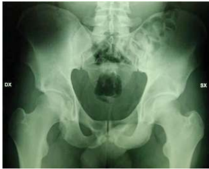
Figure 7. Lack of fusion of ossification center.

suggested by many authors, in showing inguinal hernia or alterations of posterior inguinal canal wall (sports hernia) 20 . MRI is the imaging of choice for detailed morphological and elevated contrast resolution images. T1W sequences are properly anatomic ones showing a good anatomical representation of the examined structures. T2W sequences and T2W fat suppression images show good contrast among different type of tissues. MRI for this pathology may show hyperemia and edema of sub-chondral bone in cases of symphysis pubis arthropathy and insertional tendinopathy 21 . Moreover, an MRI may show possible obscure or stress fracture and, in case of doubtful ultrasonography, muscle pathology 22 .