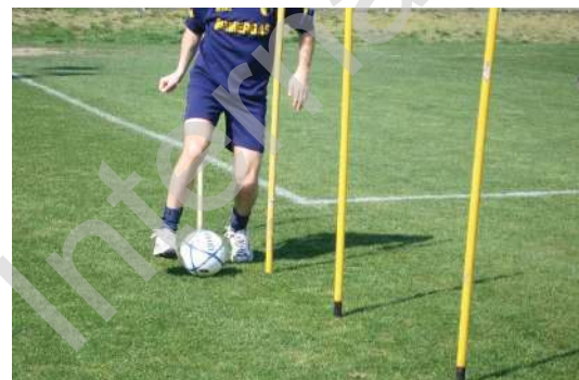
Figure 11. Return to sport phase.

In case of surgical intervention, patients return to sport activity after a period of about 3 months.