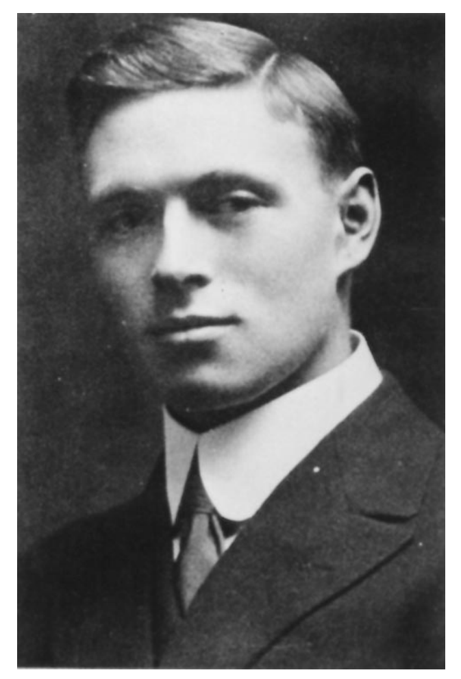
Fig. 4. James Bertram Collip. From The Discovery of Insulin . ©1982 by Michael Bliss, The University of Chicago Press.

was precipitated. Using this cutoff point he could remove most of the protein contaminants as a precipitate below 90% alcohol, then move to a higher concentration to precipitate and then isolate the active principle, as a powder, still with impurities but far purer than any previous extract. Collip tested the potency of the powders with methods he developed, using rabbits for the assay. After checking them for abscesses, he realized he had an extract sufficiently pure for testing on humans. Collip had found that pancreatic extracts were effective in lowering the blood sugar of healthy rabbits just as extracts had been in lowering blood sugar of diabetic dogs. This had great practical importance for it dispensed with the need to use depancreatized dogs for testing the potency of a batch of extract. This could now be done quickly and easily by testing the blood, easily obtainable from a vein in the rabbit's ear, and using the new micromethod of Shaffer-Hartmann. Clark Noble was added to the team to help with the rabbit testing. Macleod claims to have suggested using rabbits, which Collip then acted on (17, 33, 34).