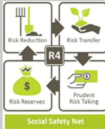
Fig. 21.3 The R4 Rural Resilience Initiative

Policy holders: 40,000 Smallholder farmers' livelihoods in drought-prone regions with a sum insured of USD 2.2 million, premiums of USD 370,000, and payouts USD 450,000 (2015)