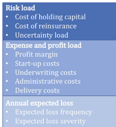
Fig. 21.2 Costs contributing to catastrophe insurance premium Source Adapted from Cummins and Mahul (2009)

The insurance premium tends to be inflated above the ‘actuarially fair value’ or ‘pure premium’ (expected losses) due to the fact that on top of the annual expected losses a risk premium is charged. As shown in Fig. 21.2, the risk premium is determined by two factors: expense load and risk load (Pollner 2000). Additionally, in the case of private insurance a profit margin is charged. In general terms the expense load reflects the costs of the insurer doing business, and the risk load includes the cost of holding capital, reinsurance and of assuming uncertain contracts for high-level risks. The risk load distinguishes catastrophe insurance from other types of insurance, like life and health, since insurers covering catastrophic risks must be prepared to pay claims for disasters that affect whole regions or countries at the same time (co-variate risk). Still, if insurers are sufficiently diversified, the risk load will not only insulate them from large losses at one time, but will also in the long run result in significant profits.