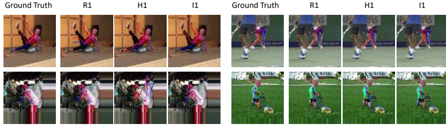
Fig. 3. Example results of regression baseline (R1), detection baseline (H1) and integral regression (I1).

From the above comparison, we can draw two conclusions. First, integral regression using an underlying heat map representation is effective ( I^* > H , I^* > R ). It works even without supervision on the heat map. Second, joint training of heat maps and joint coordinate prediction combines the benefits of two paradigms and works best ( I > H, R, I^* ).