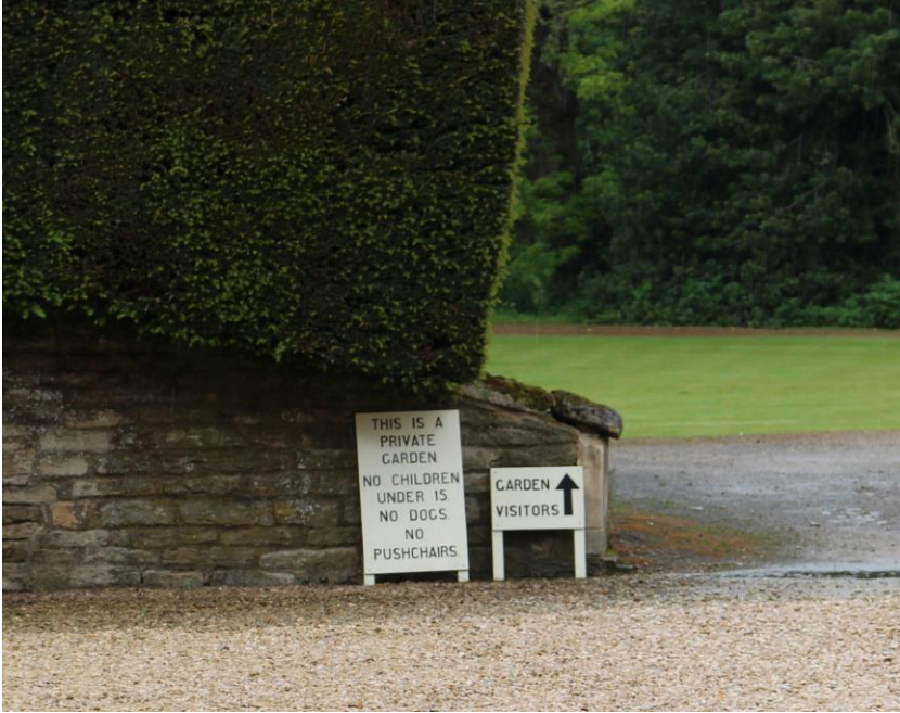
Fig. 5. Information media. Rausch. Britain.