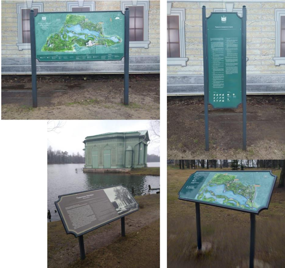
Fig. 3. Navigation system. Gatchina park.

The considered museum-reserves, independently of each other, have developed navigation systems for their architectural landscapes over the course of several years. Comparing the selected approaches, it is revealed that the ensemble-historical principle of inclusion in the environment is the basis for design. At the same time, such a method for a monument close to stylization “can enhance or reduce the contrast of the projected environment with respect to the exposed object, however, a significant number of stylized elements and a high degree of their approximation to the historical appearance interferes with a reliable perception of the monument and its environment” [10] and it should be handled with extreme care.