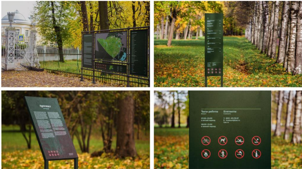
Fig. 1. Navigation system. Alexander Park. ZOLOTogroup project performance, 2017.

In 2015 to 2016, to navigate through the territory of Babolovsky and Alexander parks, a concept was developed by the authors of ZOLOTogroup (Moscow). The design was based on the tasks of creating infrastructure and organizing event scenarios in the following areas: history, health, and ecology. A complete navigation system was formed that previously did not exist only in the Catherine Park. A special design of information media, stands with maps for easy orientation, signs of all places of attraction for visitors: entrance and recreation areas, cafes, sports grounds, and the main landscape compositions have been developed. The palace and park ensembles are distinguished by high landscape and biotypic diversity and the complex composition of flora and fauna.