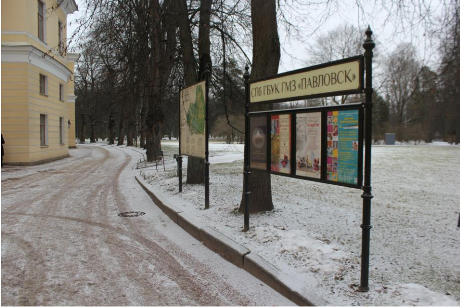
Fig. 4. Map-scheme. Pavlovsky Park.