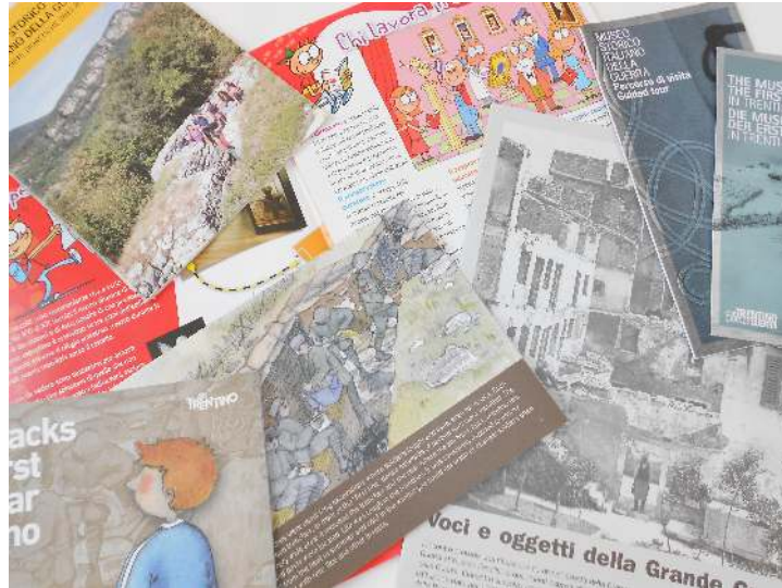
Figure 1: Museums produce a large variety of material tailored to specific visitors: the colourful, treasure hunt brochure and the graphic story for children; the trekking for teenagers; and more reflective material for older visitors.

There is an opportunity for interaction design to take advantage of the visitors' physical experience with cultural heritage and work to integrate technology into it instead of creating a parallel and detached digital experience. This needs the right sensibility and it is not without challenges. The design of digital into physical has to consider the complex ecology of cultural heritage with the conflicting goals of curators, visitors, and technology providers: