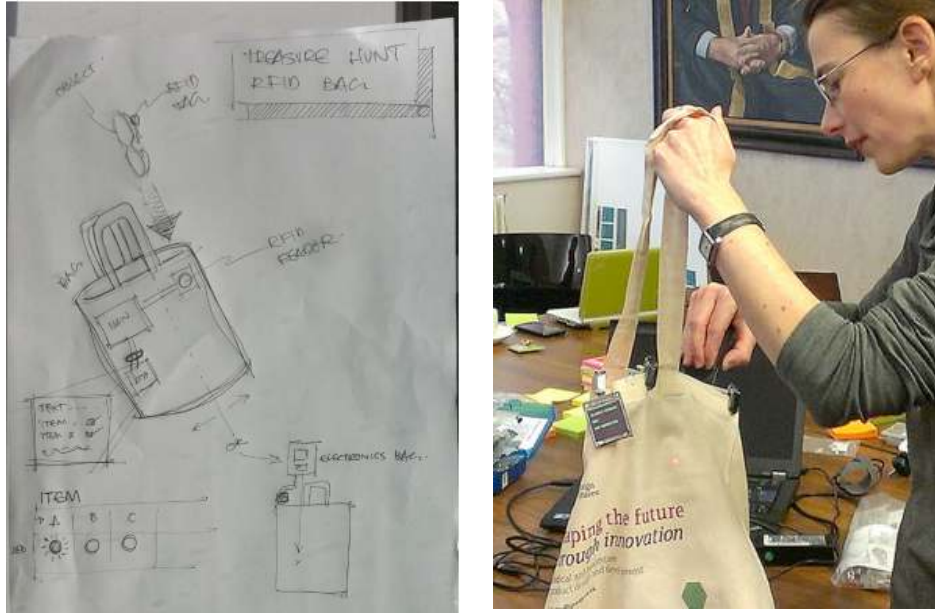
Figure 3: A concept from the co-design workshop: an interactive bag where children can collect smart items around the museum and get feedback when putting them in. The initial sketch on paper and in hardware.