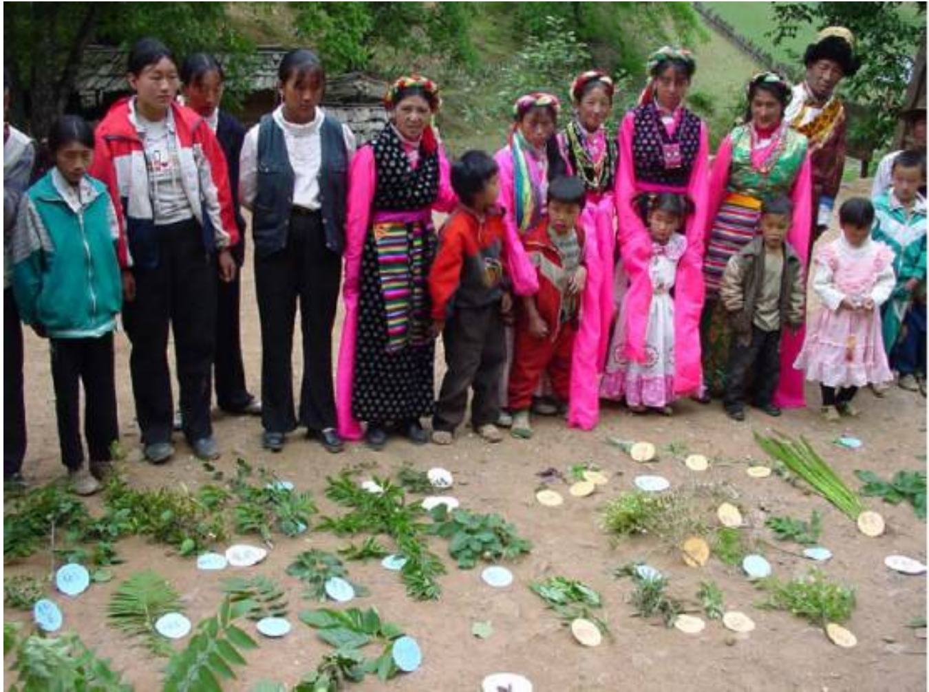
Fig. 1. In 1 h, Tibetan villagers in northwest Yunnan collected more than 80 species of local plants used as medicines, food, fiber, etc. These have been used for generations and are classified within the village's epistemological and knowledge systems.

responsibility. Pluralism in ecology, therefore, may contribute to the preservation of sacred beliefs and the conservation of landscapes.