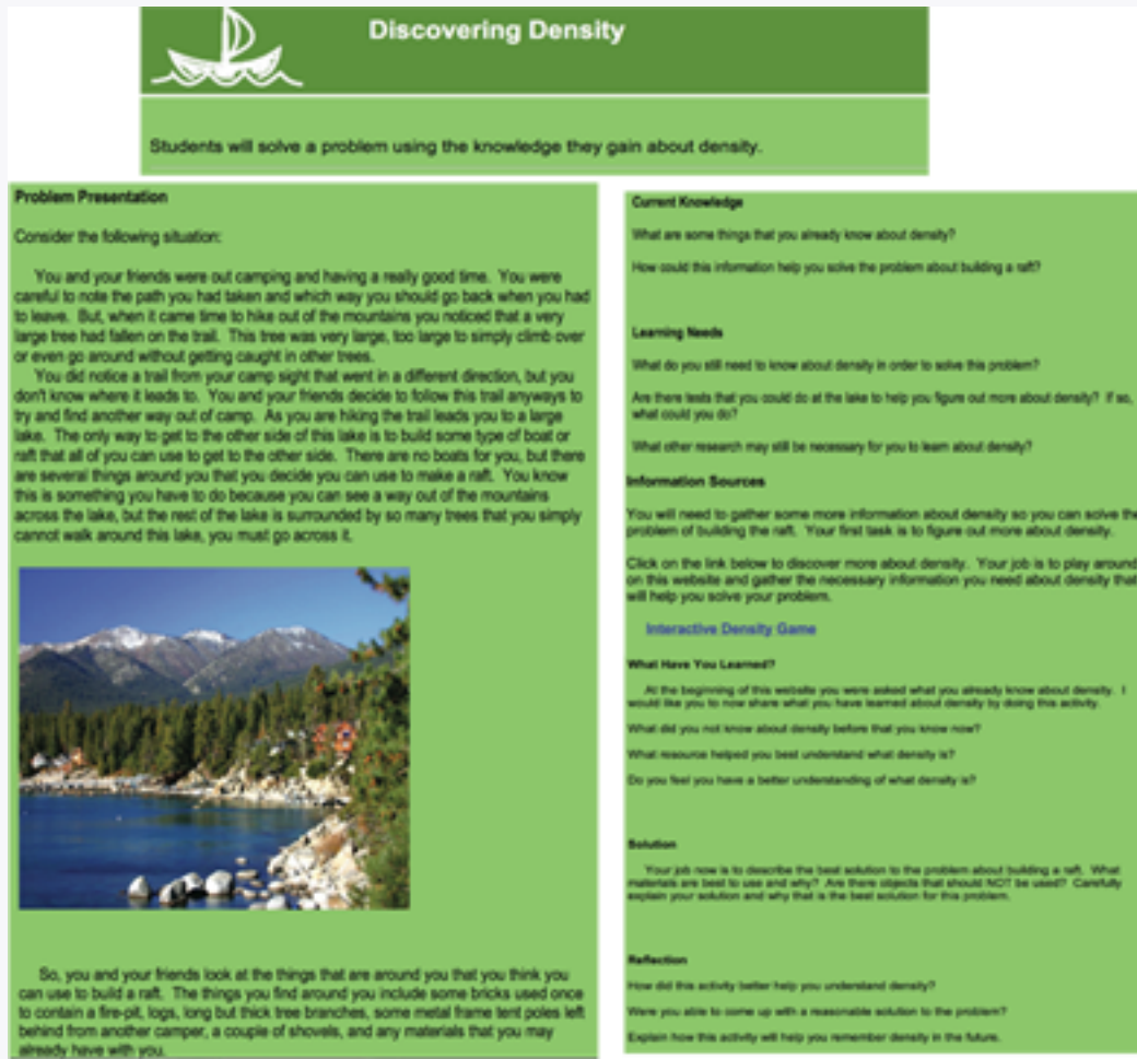
Figure 1b. Screenshot of an IA project, which includes instructions for each link.