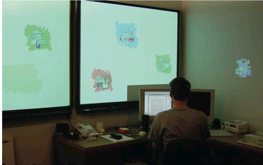
Figure 3: The Kimura system in an office environment, including the monitor and peripheral displays.

Kimura separates the user's "desktop" into two regions: the focal region, on the desktop monitor; and peripheral displays, projected on the office walls. Each work activity is associated with a unique virtual desktop that is displayed on the monitor while the user is engaged in the activity. Background activities are projected as visual montages on the peripheral display [Figure 3].