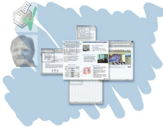
Figure 4: A montage of a working context, including a number of application windows and two external context notification cues, representing both virtual (a completed print job) and physical context information (the availability of a colleague).

The electronic whiteboard—the primary display surface for the montage visualizations—supports common whiteboard practices [4]. Whiteboards feature an intuitive user interface and are well-suited to supporting informal information management activities. Our system implementation incorporates existing electronic whiteboard interaction techniques with montages and notification cues [13, 14]. This allows the user to annotate montages with informal reminders and reposition montages to indicate the respective priority of background activities. Additionally, the whiteboard’s large display area is an ideal, unobtrusive location to show contextually relevant information about the user’s work activities and the context information sensed from around the office.