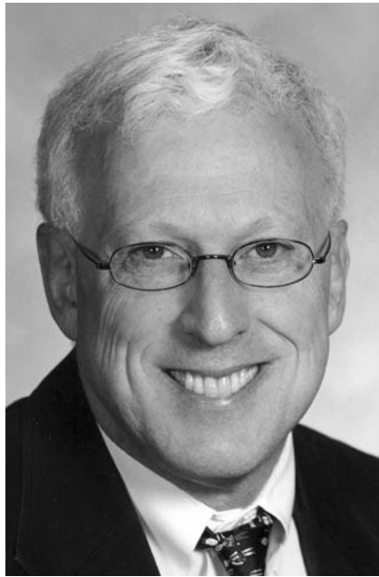
Robert J. Sternberg

1997; Sternberg et al., 2000) or to eight distinct multiple intelligences (Gardner, 1999a, 1999b).