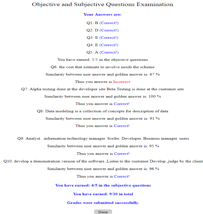
Figure 3. Assessment Output of the Exam Paper.

The electronic system interfaces of users and exam paper implemented using PHP and java script languages. The system database implemented using my SQL. The assessment algorithm for exam paper implements using python program. After the student has solved exam, student answers with reference answers evaluated using assessment algorithm. Figure 3 shows bellow assessment results of the exam paper.