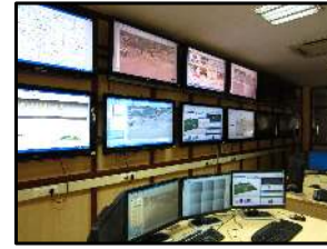
Figure 4. Bengaluru Traffic Control Room

Choice of sensing method - Participatory sensing data is inherently noisy [52]. Also probe vehicles might not be present at a given intersection at all times. Such sensing methods can thus be used for applications like travel time estimates and congestion maps to be disseminated to commuters, which can tolerate aperiodicity and noisiness. Applications like traffic light control on the other hand, need