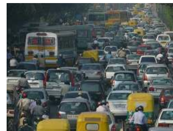
Figure 2. Indian traffic (source [19])

New techniques for chaotic traffic - Apart from adapting traditional sensors to chaotic traffic, efforts can be made to design new sensing solutions for chaotic traffic. If these solutions are low-cost and deployable on road-side, (under road sensors like loop hamper flow during installation and maintenance), that will add greater value. We have come up with two such techniques based on acoustic sensing [2, 3] and RF sensing [4]. There are several other options to explore like passive infrared sensors, pollution sensors, vibration sensors etc. For each technique, some of the key questions to explore are - (a) what to sense, (b) how long to sense to handle the real-timeliness vs accuracy trade-off, (c) how to build sensing models for different road widths and vehicle types with minimum manual supervision etc.