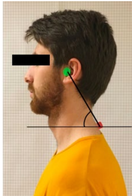
Figure 1. Craniovertebral Angle Landmarks

Even though CV angle is a valid measurement in clinical settings, the current circumstances present a unique problem. With the increased utilization of telehealth due to social distancing guidelines, physical therapists (PTs) are delivering care through telehealth (Exum et al., 2020; A. C. Lee, 2020). Increased use of telehealth means that PTs are now required to assess and treat patients using some type of video conferencing application such as a HIPAA-compliant video-based telehealth platform. It is not yet known whether the psychometric properties of CV angle measurement, validated under in-person clinical settings, translate to a virtual environment. We believe that specific PT clinical measurements should be validated in a telehealth setting before being applied in such settings.