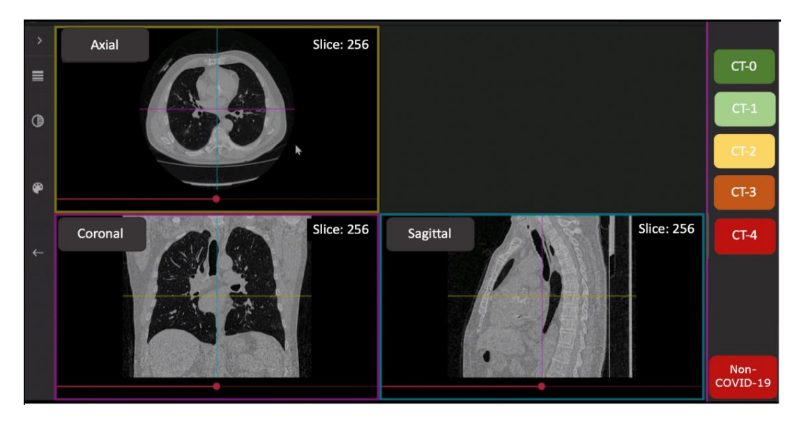
Figure 1. The interface of the FAnTom software tailored for CT0-4 grading.

Reading of CT scans was performed by ten radiologists with 3–25 years' experience, and trained in COVID-19 pneumonia interpretation. The FAnTom software version 1.2 (Moscow, Russia) [28,29] was modified to assess disease severity according to the CT0-4 scoring scheme (Figure 1); it was also used to facilitate annotation and provide the radiologists with online access to a randomly selected set of anonymized studies.