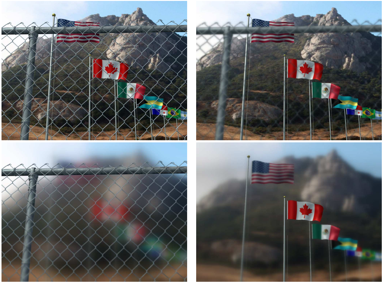
Figure 6: The image at the top left is an in-focus view of a scene that we render with our 3-layer DOF algorithm. Clockwise from top right, we show the results of our algorithm with cameras with a narrow aperture and a mid-distance focal plane; with a wide aperture and a distant focal plane; and with a wide aperture and a near focal plane.

HILLESLAND, K. E., MOLINOV, S., AND GRZESZCZUK, R. 2003. Nonlinear optimization framework for image-based modeling on programmable graphics hardware. ACM Transactions on Graphics 22, 3 (July), 925–934.