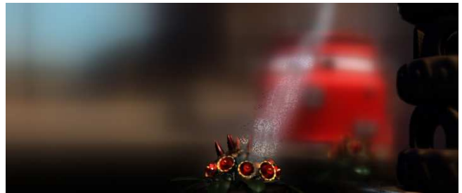
Figure 1: Top: Pinhole camera image from an upcoming feature film. Bottom: Sample results of our depth-of-field algorithm based on simulated diffusion. We generate these results from a single color and depth value per pixel, and the above images render at 23–25 frames per second. The method is designed to produce film-preview quality at interactive rates on a GPU. Fast preview should allow greater artistic control of depth-of-field effects.