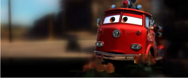
Figure 2: Top: original pinhole image. Bottom: image with simple DOF.

Potmesil and Chakravarty [1981] describe how to compute the circle of confusion for each pixel from its depth and a full set of camera parameters. From this circle, we can now compute \beta , and complete Equation 5.