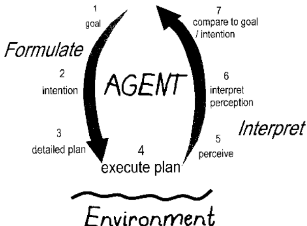
Figure 1. In this image of the seven step decision cycle the agent proceeds in a linear fashion, first formulating a goal, converting the goal to an intention to act, translating the intention into a detailed plan, then acting in accordance with the plan, perceiving the results, interpreting the goal relevance of the perception, then comparing the perceived outcome to the original goal and then starting over again.

which interface action corresponds to a physical action, the principle of visibility enjoins presenting icons, pull down menus and context sensitive mouse actions, as ways of saving the user from having to memorize both the actions that are available and their implementation in the interface. Thus, if we cannot guess what is possible we can find out by consulting a list on a pull down menu, or clicking right on the mouse.