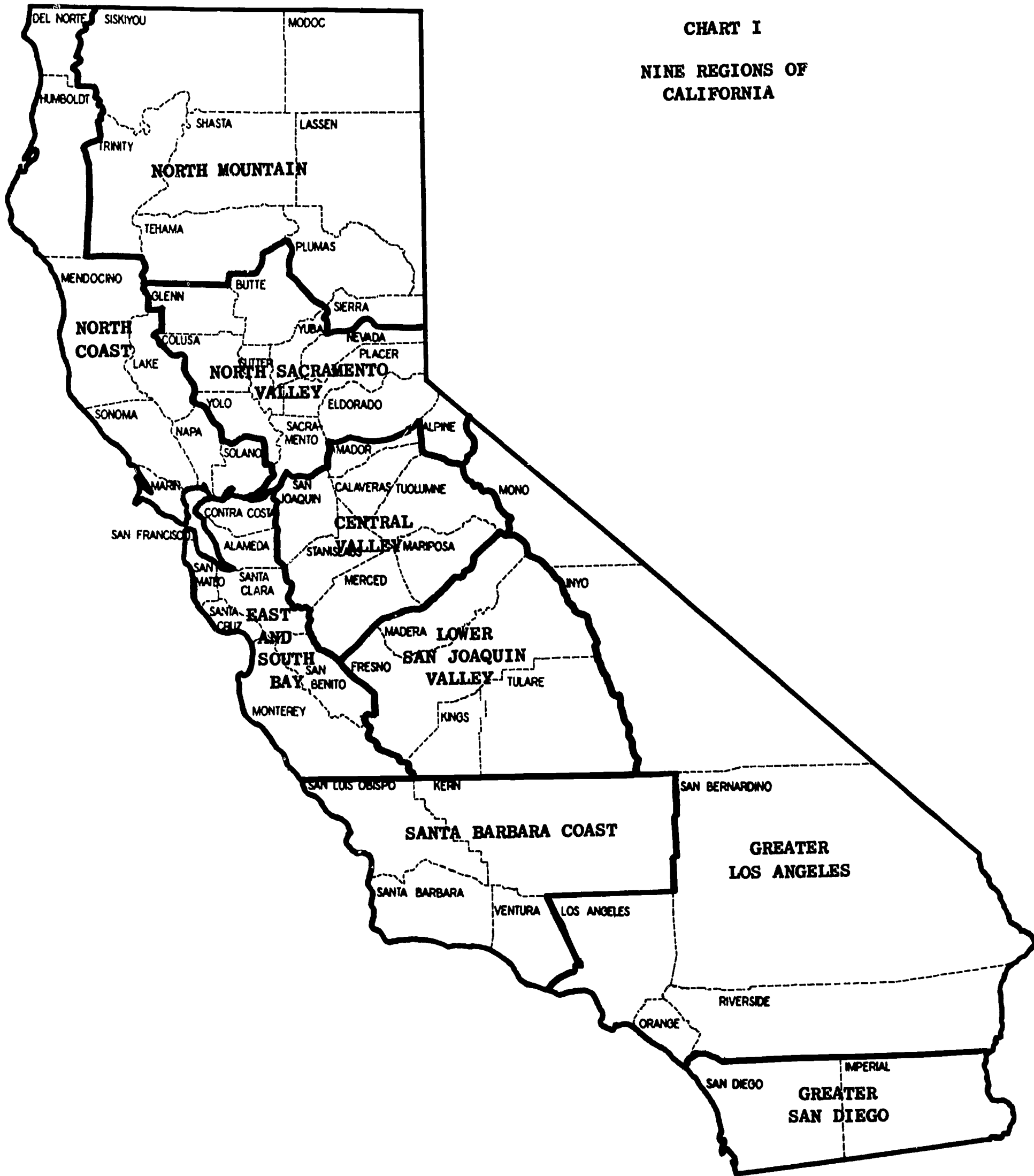
CHART I NINE REGIONS OF CALIFORNIA