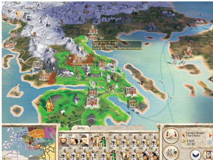
Figure 3. The Campaign Map RTW (screenshot).